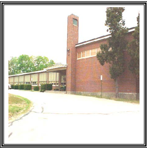
South Elementary School